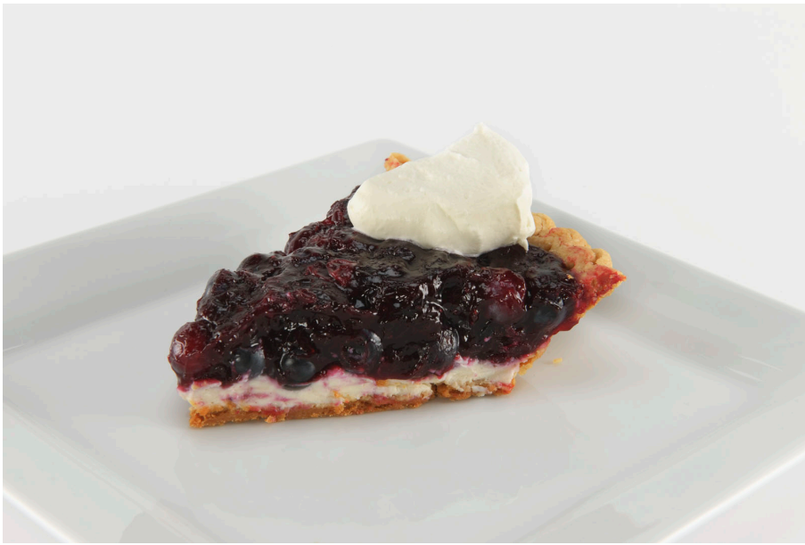
image: maker's mark

Sweet blueberries pair perfectly with the slightly salty cream cheese, and the bourbon laces it all together in every sweet, savory bite. Get the recipe.