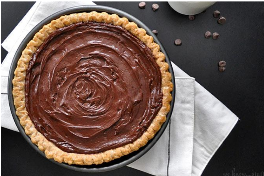
It's a pie kind of day.

There is nothing quite like a pie. Utterly simple but with flaky buttery crusts that pose a challenge to make, pies are the ultimate comfort food both to eat and create. From fruity pies to decadent chocolate ones to savory options that take the place of dinner, it's impossible to have